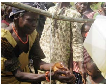
Testing the Tippy Tap for easy hand washing at Nkaleke