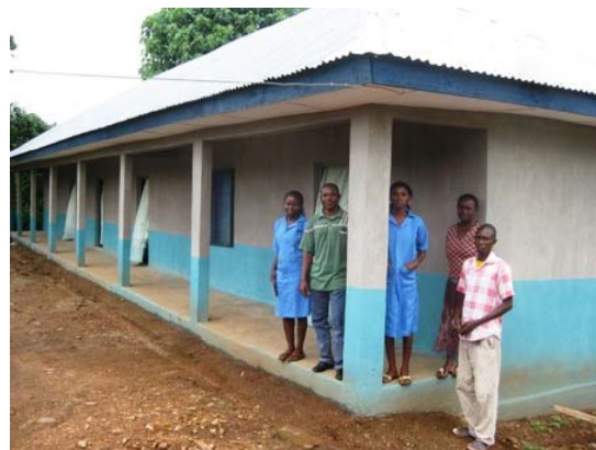
Photo – left: the water tower and tank for the electric borehole in front of the four new rooms built for the Offia Oji health center. Photo – right: some of the staff in front of the new staff quarters at Offia Oji.

The Offia Oji health center was the first of the three to get its own staff quarters. Made possible by a private donation from Switzerland, the new building contains six rooms, including kitchen, quarters for female staff, male staff and doctor. We also added four additional rooms to clinic building, a new delivery room, post-delivery ward, operating theatre, and counseling room. With the help of AMURT Italy the Offia Oji clinic now has an electric borehole and overhead tank that supplies running water to kitchen, bathroom, delivery room, operating theatre, and two outdoor taps.