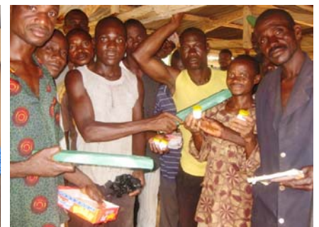
The men of Ndiokenyi proudly display the products they made after the WASHCOM training: soap, pomade and bead jewelry.