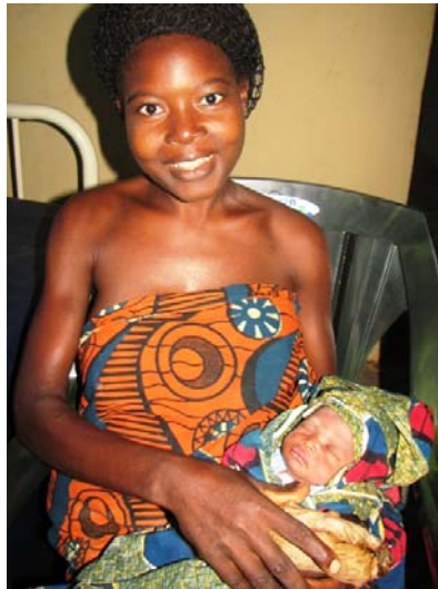
This young woman from Obegu Omega delivered at Gmelina clinic. .